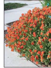
Sunrose varieties Helianthemum spp.