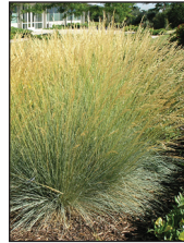
Blue Oat Grass Helictotrichon sempervirens