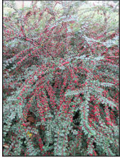
Cranberry Cotoneaster Cotoneaster apiculatus