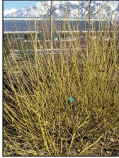
Yellow Twig Dogwood Cornus sericea 'Flaviramea'