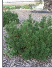
Slowmound Mugo Pine Pinus mugo 'Slowmound'