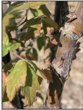
Paperbark Maple Acer griseum