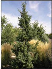
Serbian Spruce Picea omorika