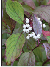
Bailey Red Twig Dogwood Cornus sericea 'Baileyi'