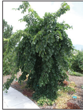
Camperdown Elm Ulmus glabra 'Camperdownii'