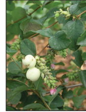
Snowberry Symphoricarpos albus