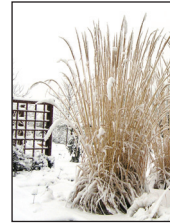
Ravenna Grass Saccharum ravennae