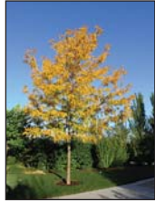
Imperial Honeylocust (fall foliage) Gleditsia triacanthos 'Imperial'