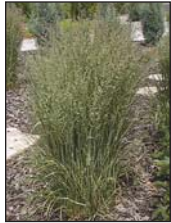
Feather Reed Grass Calamagrostis x acutiflora 'Overdam'