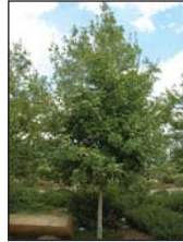
Bigtooth Maple Acer grandidentatum