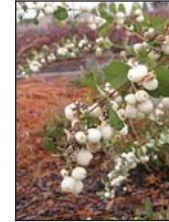
Snowberry Symphoricarpos albus