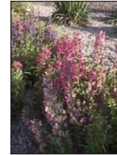
Rondo Mix Penstemon Penstemon barbatus var. praecox f. nanus 'Rondo'