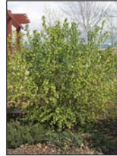
Alpine Currant Ribes alpinum 'Green Mound'