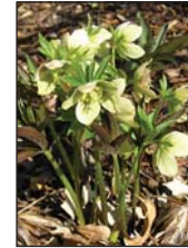
Lenten Rose Helleborus orientalis