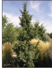
Serbian Spruce Picea omorika