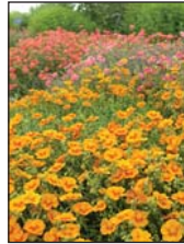
Sun Rose mix Helianthemum nummularium