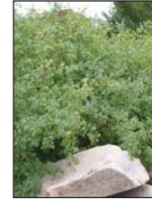
Gro-Low Sumac Rhus aromatica 'Gro-Low'