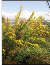
Maximillian Sunflower Helianthus maximiliani 'Santa Fe'