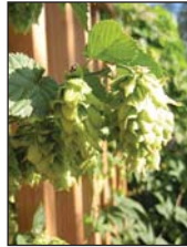
Hops Humulus lupulus