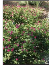
Prairie Winecup Callirhoe involucrata