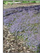
Turkish Speedwell Veronica liwanensis