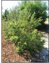
Dwarf Serviceberry Amelanchier alnifolia var. pumila